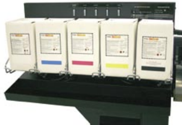
(above) SolaChrome pigmented UV inks and Printhead Cleaning Solution in 3-liter boxes for maximum productivity.

SolaChrome UV inks available in cyan, magenta, yellow and black print vibrant, high-resolution output that can withstand harsh outdoor use (2-3 years depending on the application.) The printhead assembly houses dual UV light sources that cures the ink instantly.